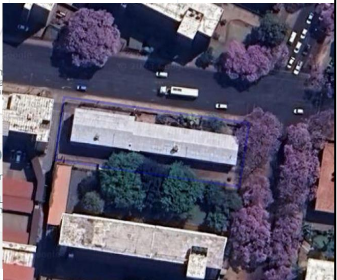
(Lat/long)/Street View -25.758476, 28.201359